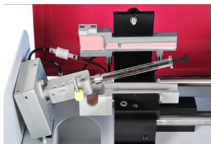
Load the syringe with sample.