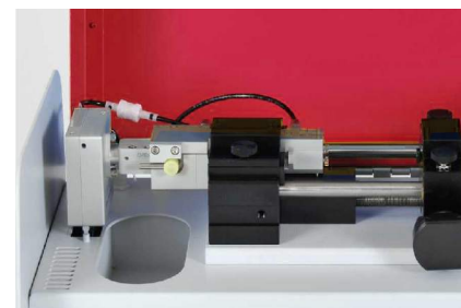
Press start and begin the measurement